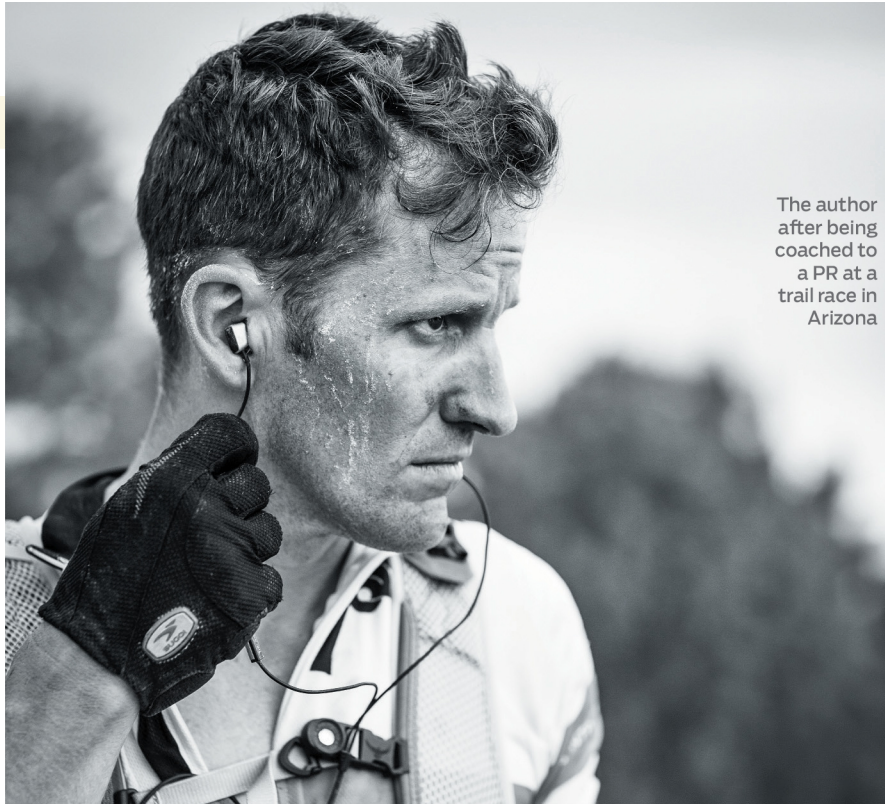
The author after being coached to a PR at a trail race in Arizona